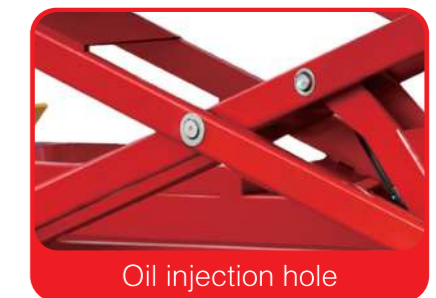
Oil injection hole