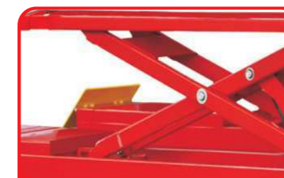
Secondary jack with extension(optional)