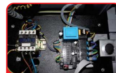
Electronic board control cabinet(optional)