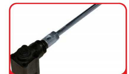
Emergency hand pump(optional)